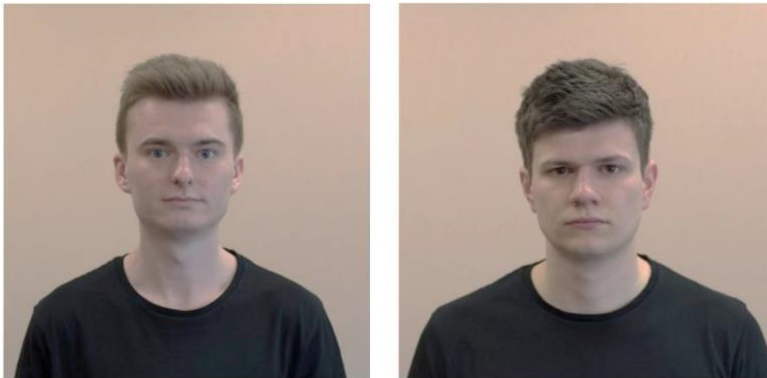
Figure 1. Example of a suspect pair.

Participants. Most participants were prospective students and their parents, recruited during university visits to learn about a psychology program. The remaining participants (~15%) were undergraduate psychology students recruited from lectures. We planned to terminate data collection when each condition reached 50 participants (a sample size with 70% power to detect a medium sized effect, Cohen's h = 0.50 , and 90% power to detect a medium-to-large sized effect, Cohen's h = 0.65 ). In Experiment 1a the recruitment target was achieved at the 9 th event, resulting in a final sample of 304 participants, and in Experiment 1b the recruitment target was achieved at the 9 th event with a final sample of 306 participants. Exclusions and demographics are reported in Online Supplemental Materials.